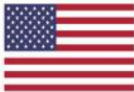
United States of America