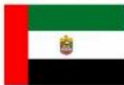
United Arab Emirates